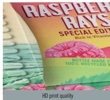
HD print quality